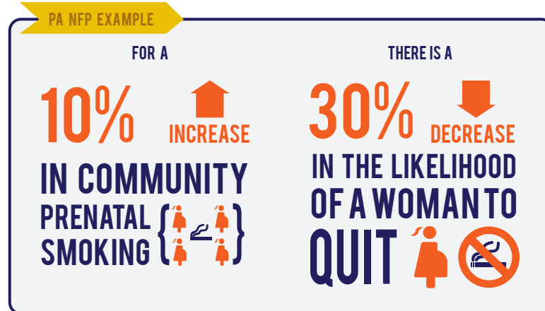
FIGURE 3: Community Context Affects Program Outcomes

3 KEY CONCEPT: Program effectiveness increases over time following wide-scale implementation.