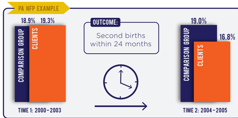
FIGURE 4: Program Effectiveness Increases With Time

4 KEY CONCEPT: Engaging stakeholders enriches program evaluation.