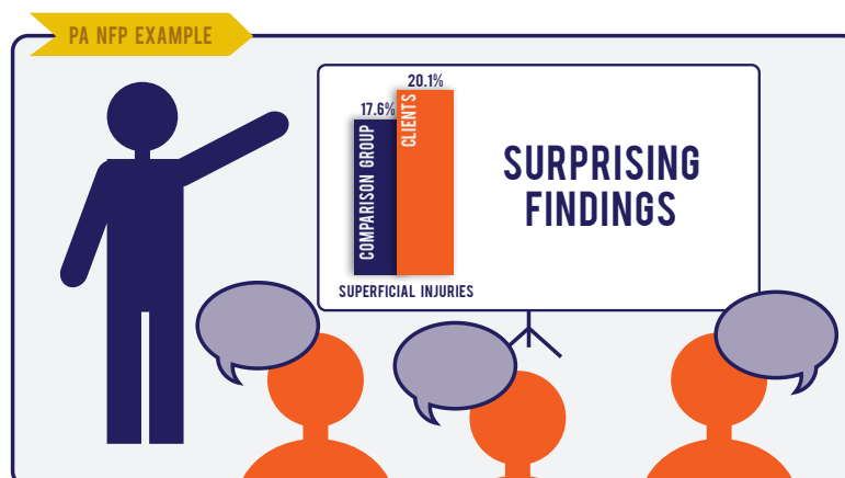
FIGURE 5: Qualitative Data Can Supplement Findings